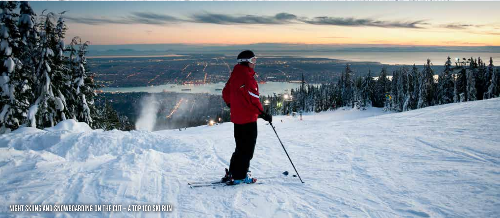
NIGHT SKIING AND SNOWBOARDING ON THE CUT – A TOP 100 SKI RUN