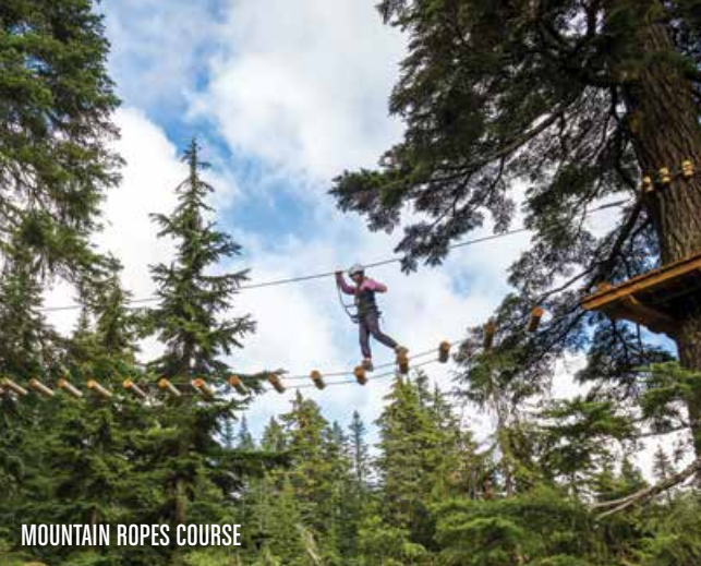
MOUNTAIN ROPES COURSE