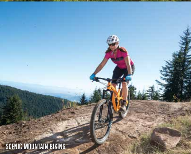
SCENIC MOUNTAIN BIKING