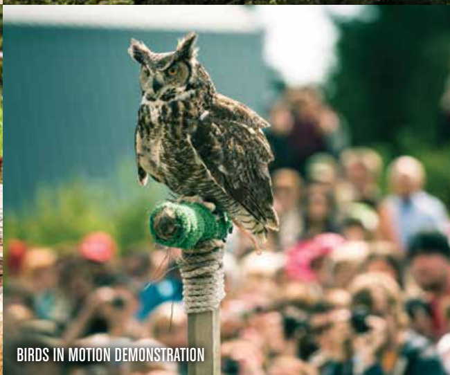
BIRDS IN MOTION DEMONSTRATION

Summer season at the Peak of Vancouver offers an incredible variety of activities suitable for the whole family, including our World Famous Lumberjack Show, 360-degree views in the Eye of the Wind, visits with our two resident Grizzly bears, dining, shopping...and much more.