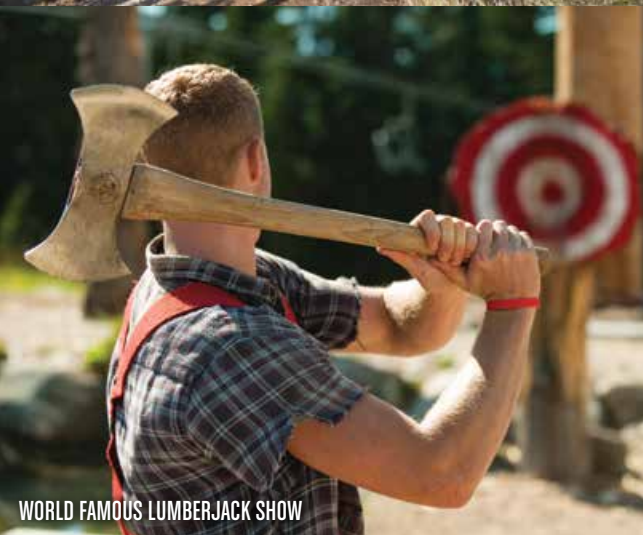
WORLD FAMOUS LUMBERJACK SHOW